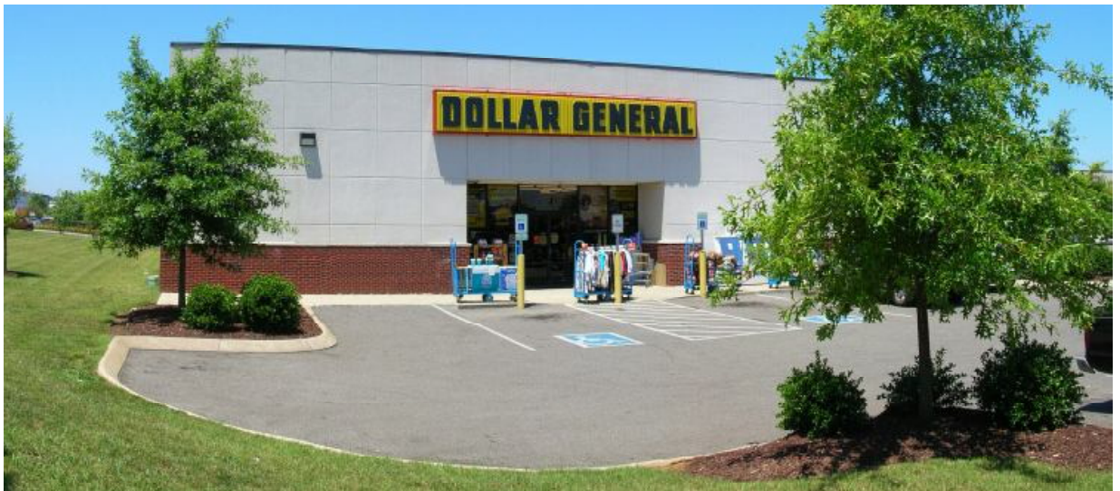
Completed Dollar General Store Smyrna, Tennessee

60 Proposed Site Designs Tennessee and Virginia Since 2006